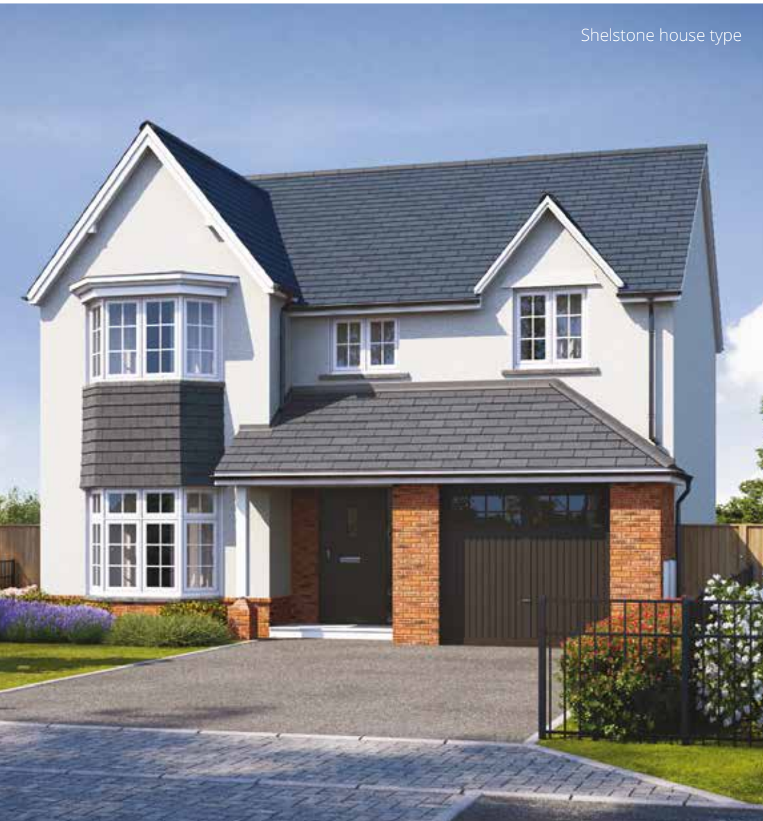
Shelstone house type

Cavanna use the finest materials selected for longevity, function and performance. Our attention to detail and quality goes beyond the build, every Cavanna Home comes with contemporary fitted kitchens, the latest heating systems, excellent wall and loft insulation and double glazing as standard. This means your house is thermally efficient, comfortable and beautifully stylish. Tailoring your dream home is a delight with Cavanna. Our superior range of finishes in the kitchen, bathroom and flooring means you can make your house a home before you even move in. Please do talk to one of our Sales Advisors about our standard options and optional extras*.