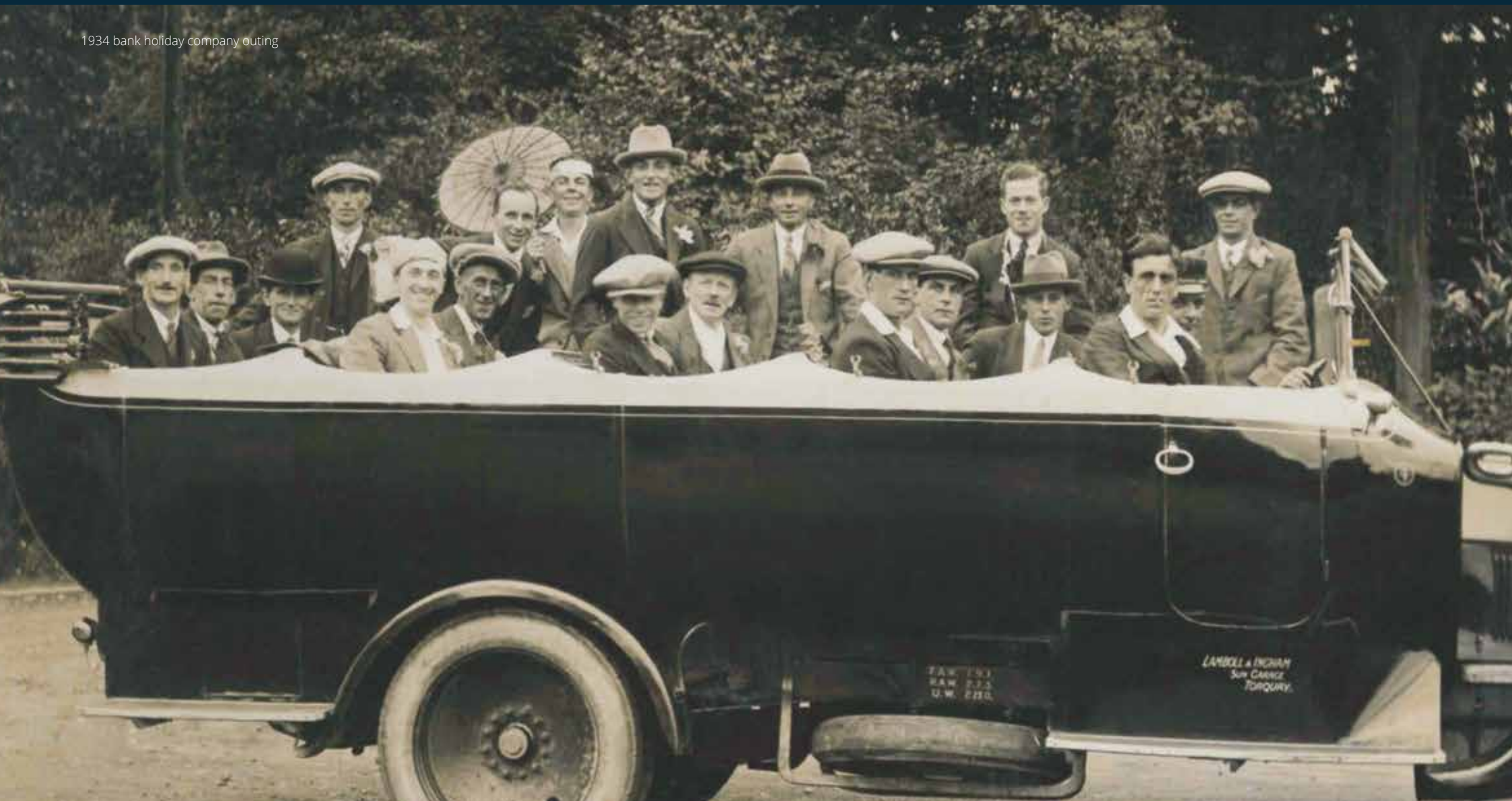
1934 bank holiday company outing