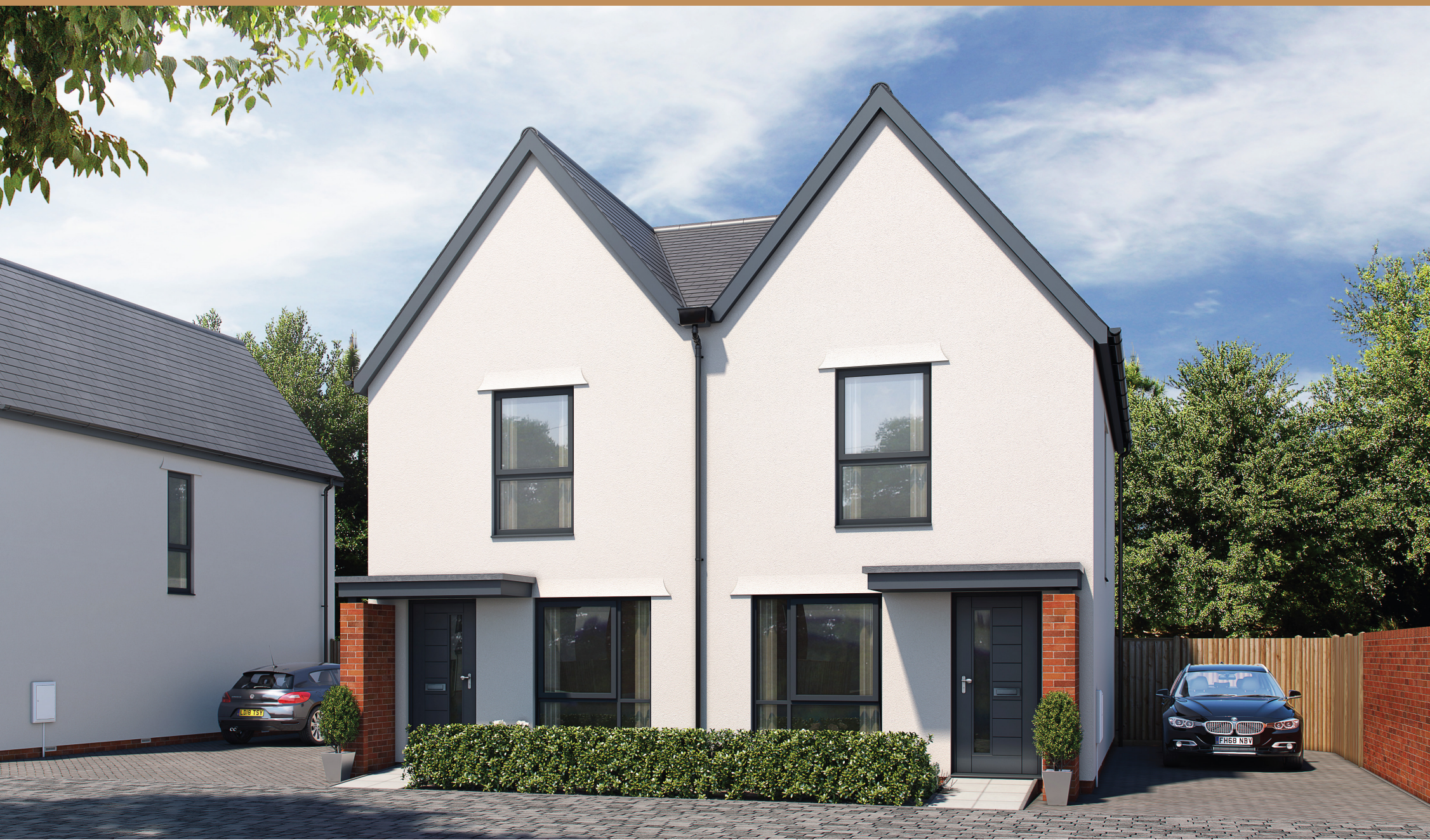
RIPPON | 2 BEDROOM HOUSE | 65m 2